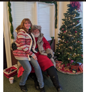
Top Left: Moncks Corner Trunk or Treat, Top Right: International Credit Union Day in Myrtle Beach, Bottom Left: Palmetto Day for Spirit Week, Bottom Right: Santa at Myrtle Beach